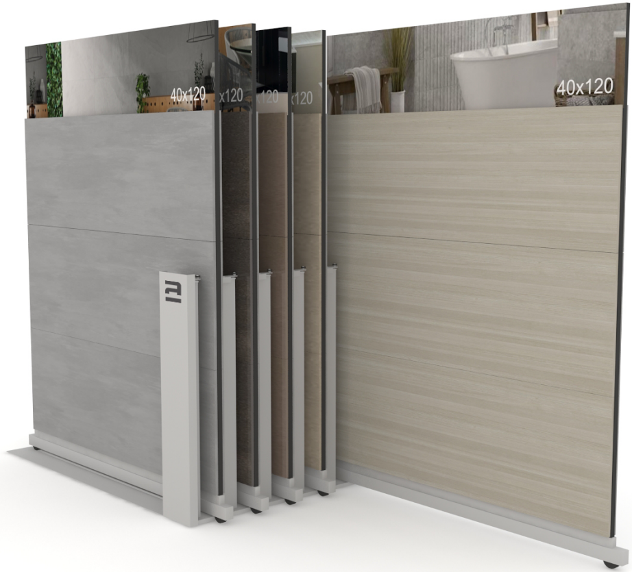
Ref img: Big Size Board 5x2p