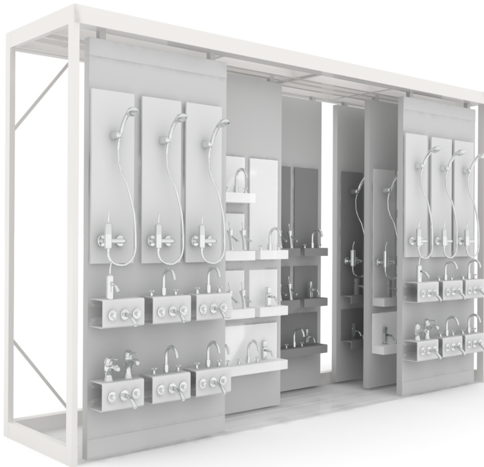
Imagen/Image BATH - Tehnik Bath Taps

Blanco/White Plata/Silver Grafito/Graphite Negro/Black