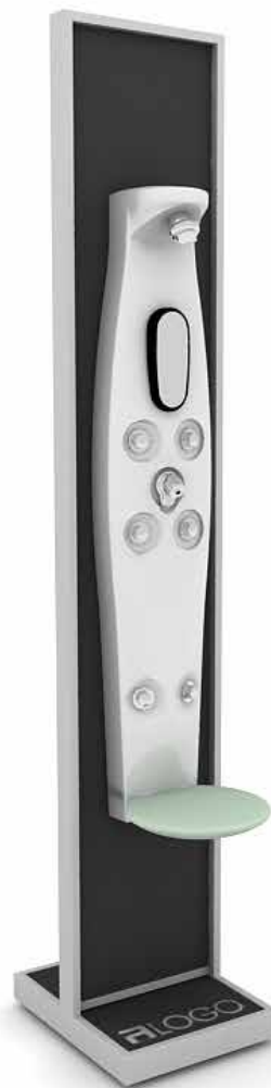
Imagen/Image Arrow III 2C

dimensiones expositor (mm) display dimensions