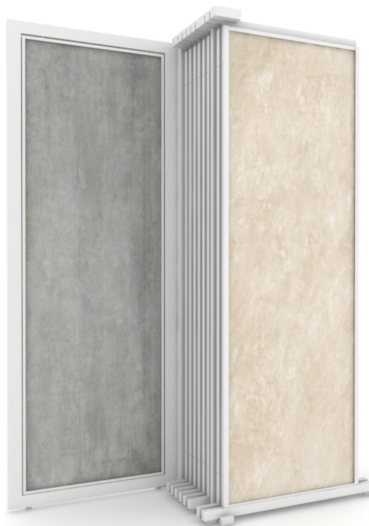
Imagen/Image Less-XL 8+2P