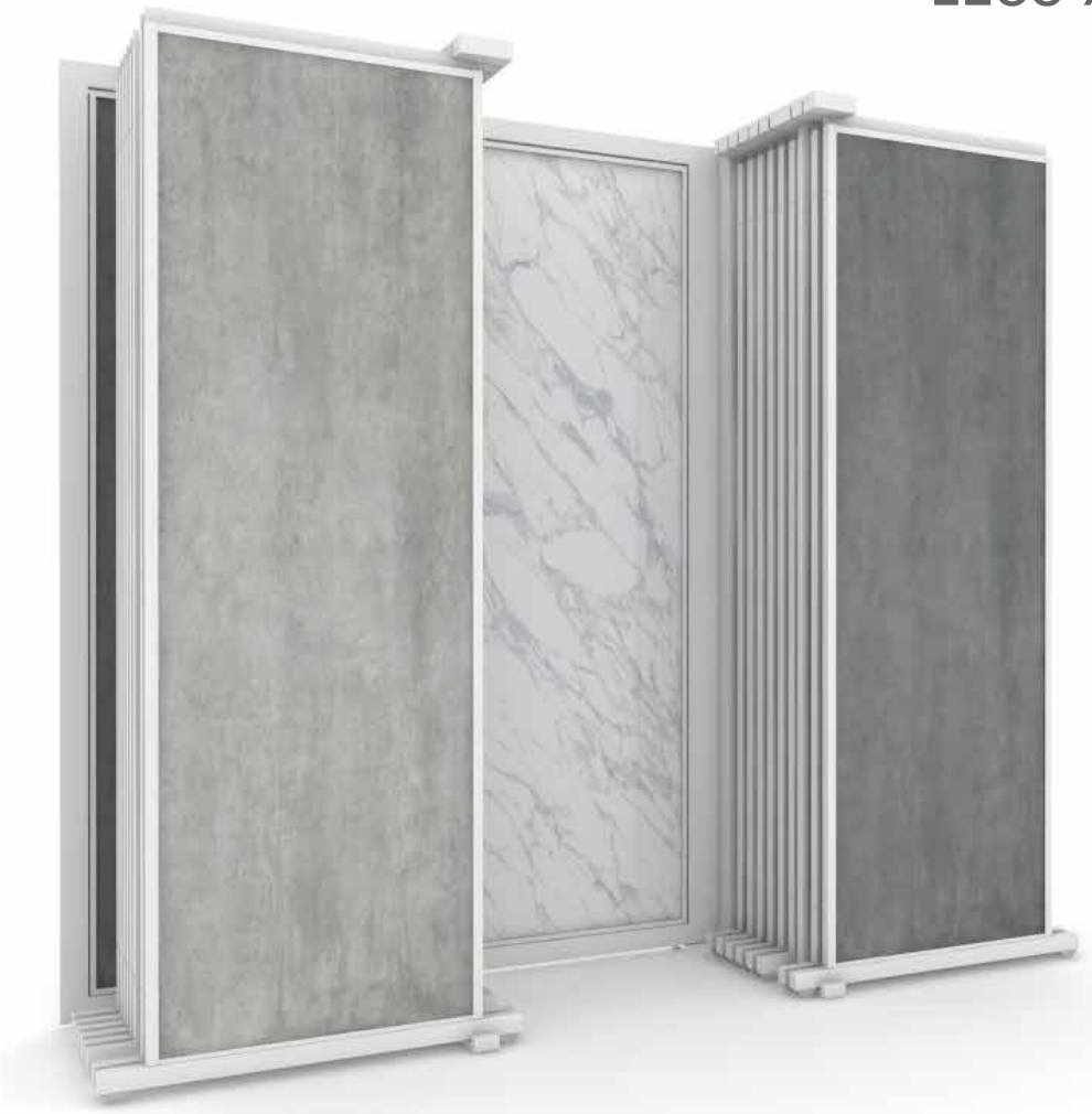
Imagen/Image Less-XL 16+3P