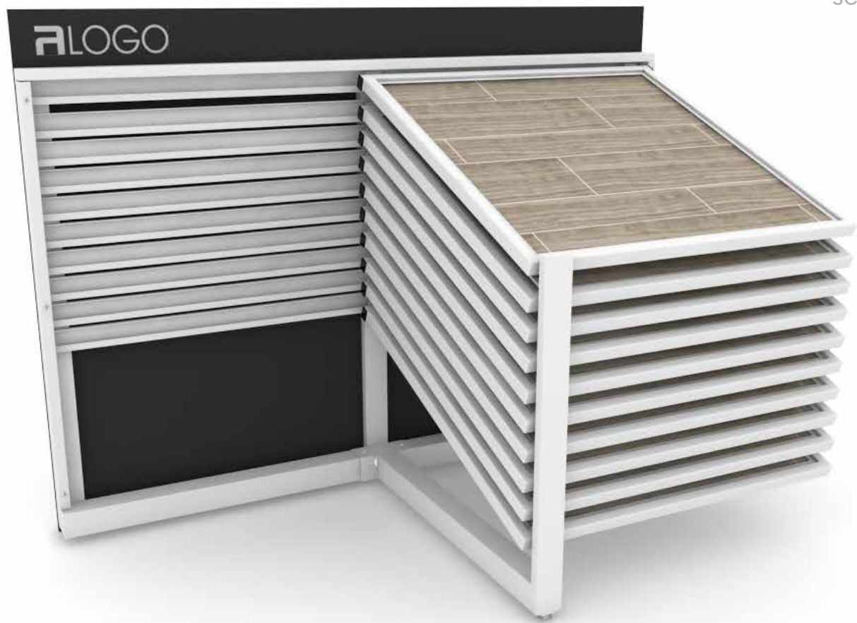
Imagen/Image Kasos-Pi 10P+T-101