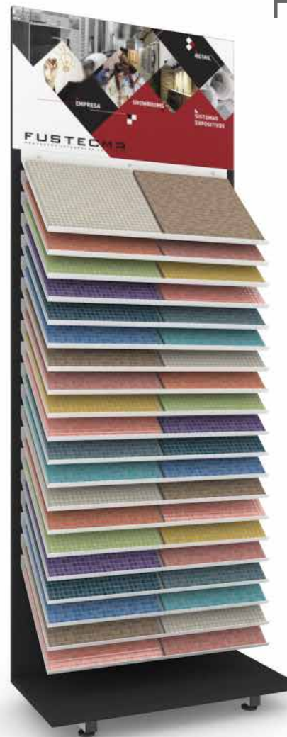
Imagen/Image Flow 20+20P-330