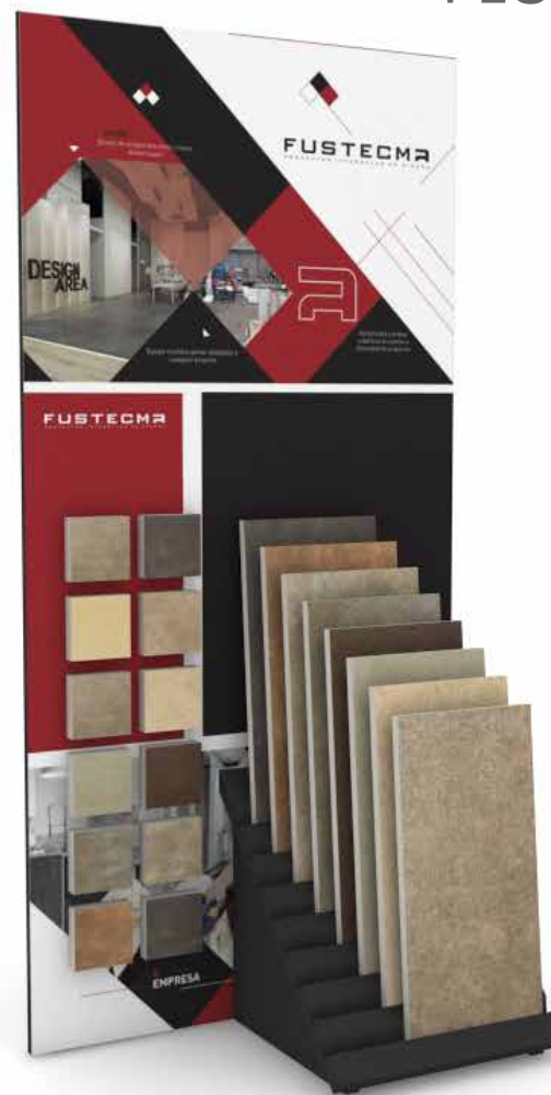
Imagen/Image Plug Pi 8P+T 40x500

Blanco/White Plata/Silver Grafito/Graphite Negro/Black