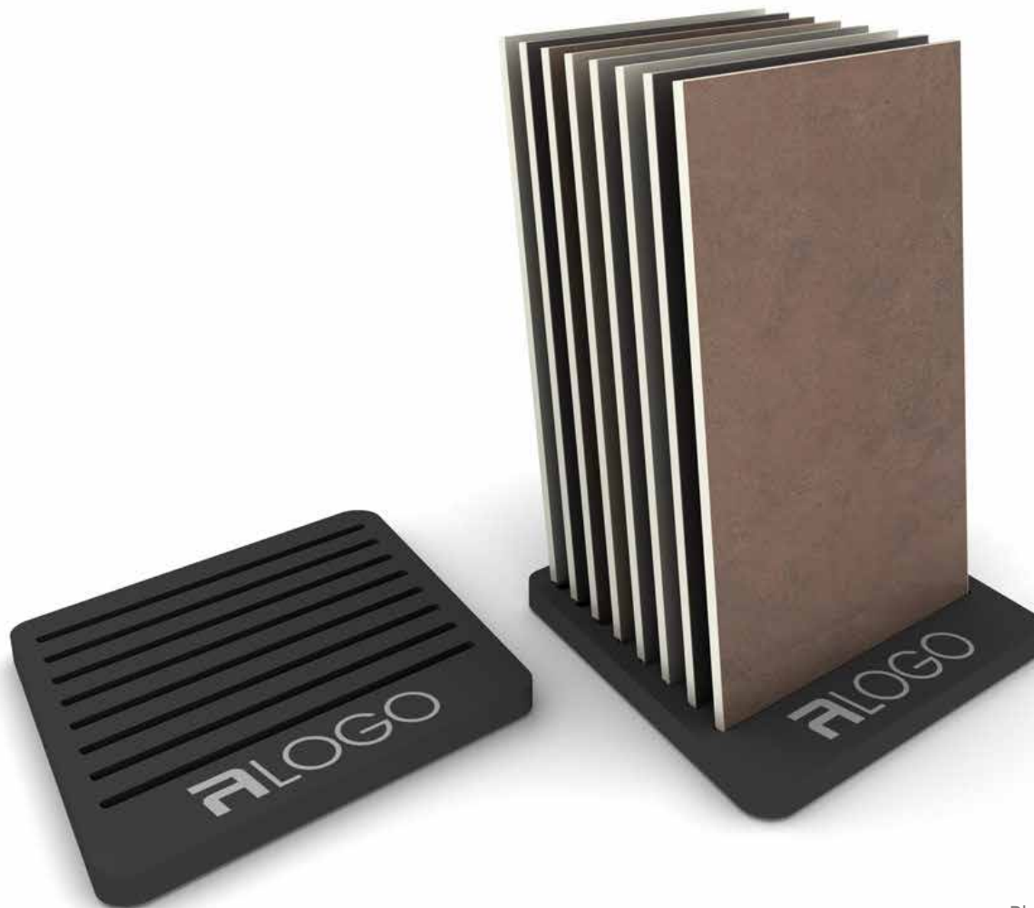
Imagen/Image Plug Just Ob 8P-400