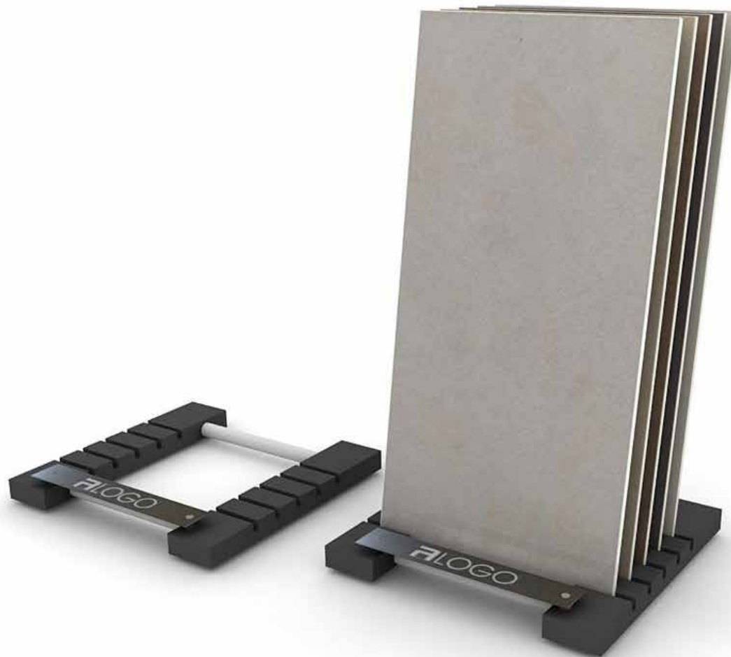
Imagen/Image Plug Pn Twin 5P

Blanco/White Plata/Silver Grafito/Graphite Negro/Black