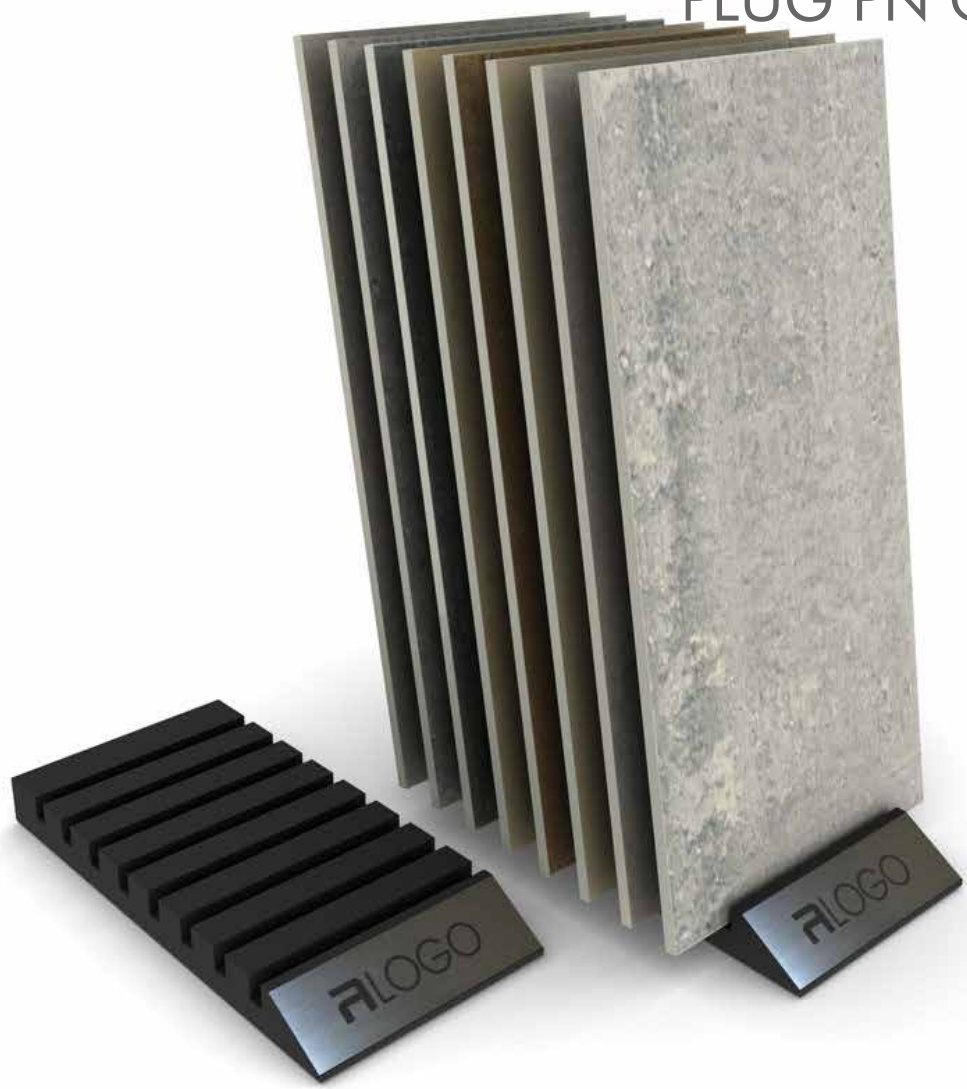
Imagen/Image Plug PnCu 8P-200