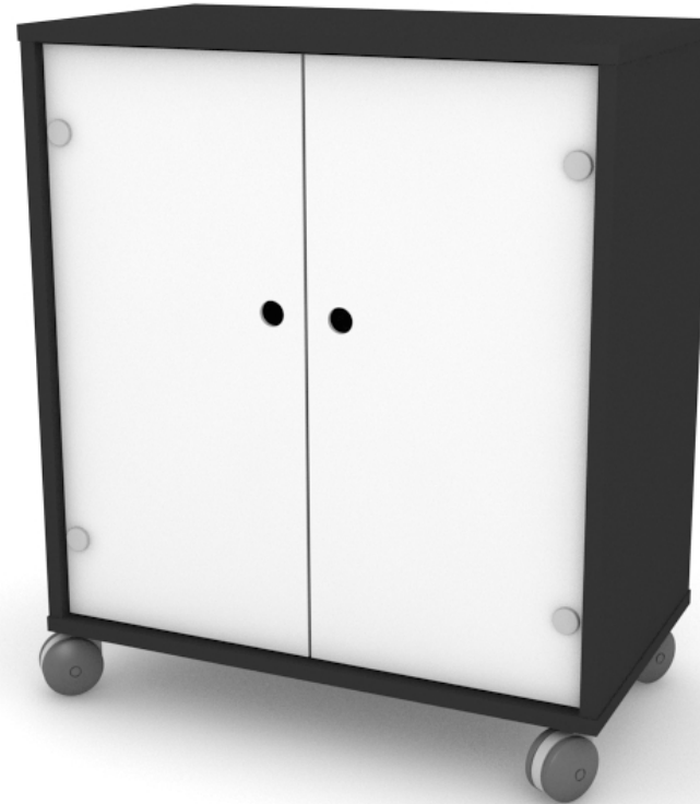
Imagen/Image Auxiliary Box F700

Blanco/White Plata/Silver Grafito/Graphite Negro/Black