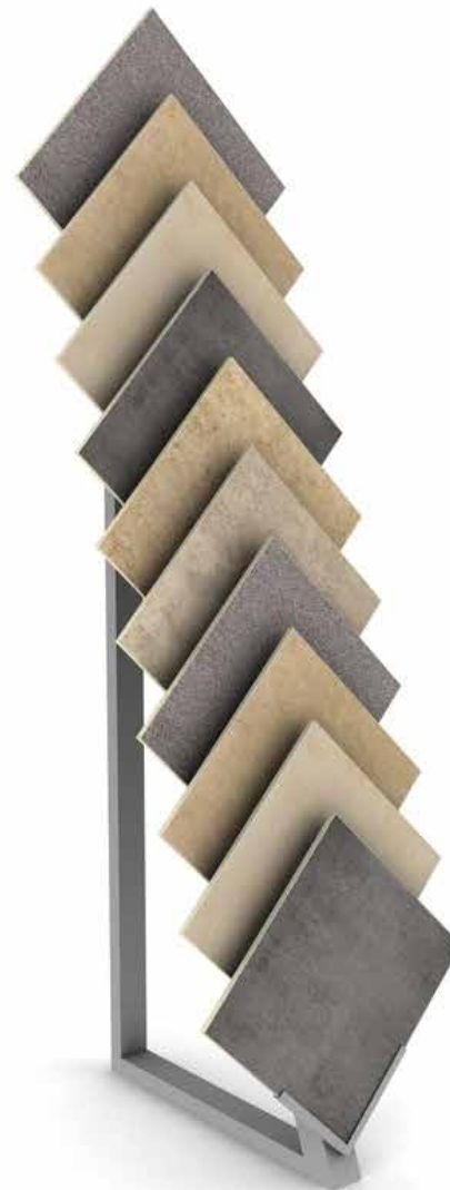
Imagen/Image Fall 10P