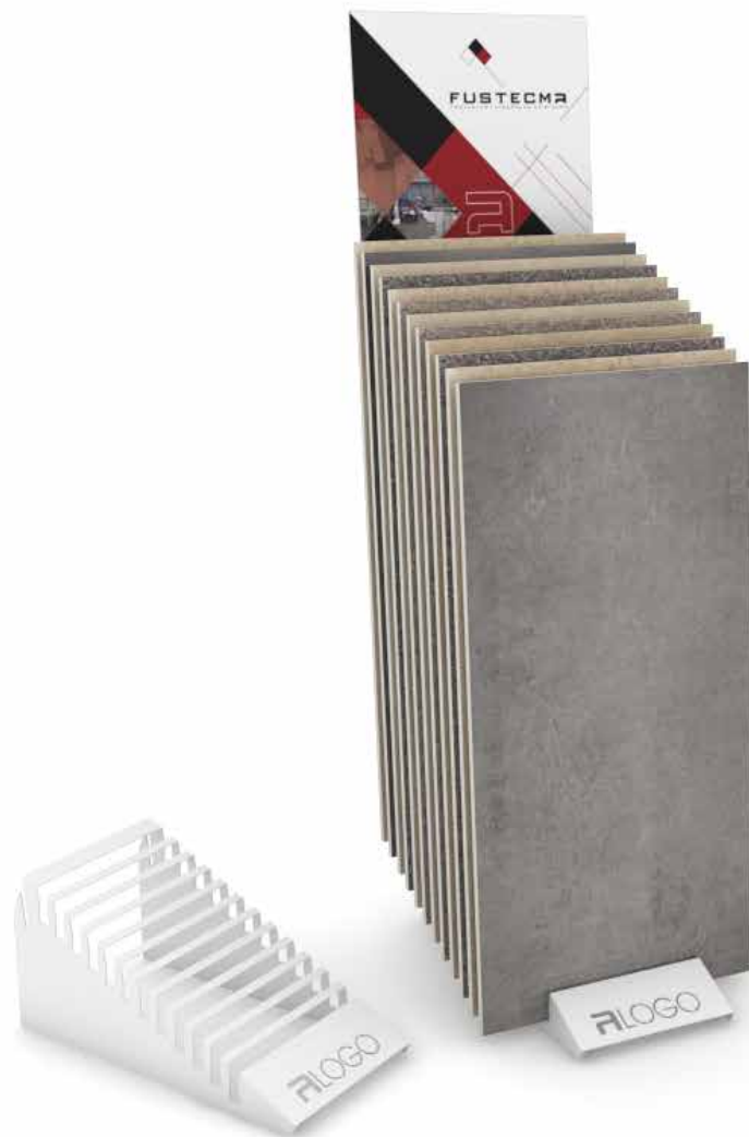
Imagen/Image Step 12P+T