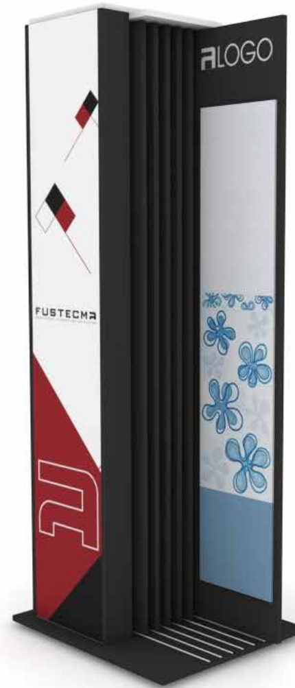
Imagen/Image Altair 6P-400

Blanco/White Plata/Silver Grafito/Graphite Negro/Black