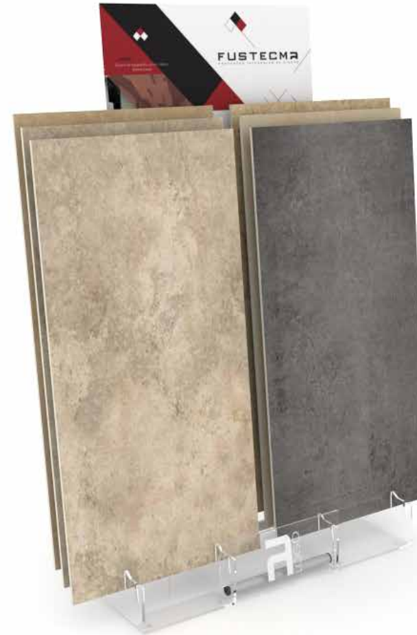
Imagen/Image Play Pi Twin 3+3P+T 30x300