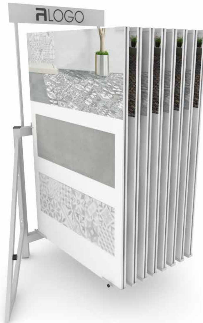
Imagen/Image Roll V2-16P